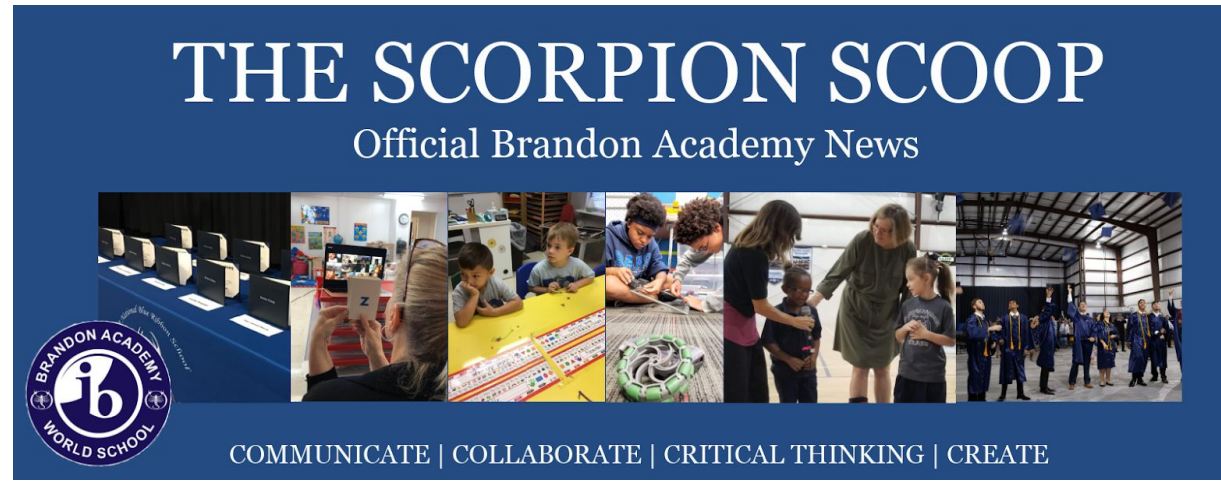
From the Head of School October 23, 2020

Dear Colleagues, Parents, Students, and Friends,