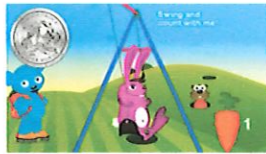
Park Math - Duck Duck Moose